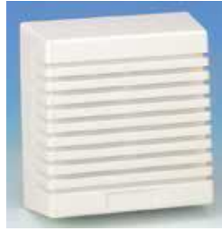
Indoor Speaker (746)