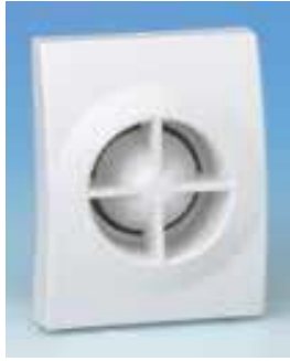
Two-Tone Siren (Wave 2)