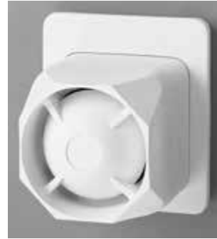
Dual Tone Siren (748)