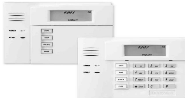
WITH DOOR ATTACHED