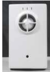
Wireless Siren (5800WAVE)