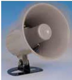
Self-Contained Electronic Siren (719)